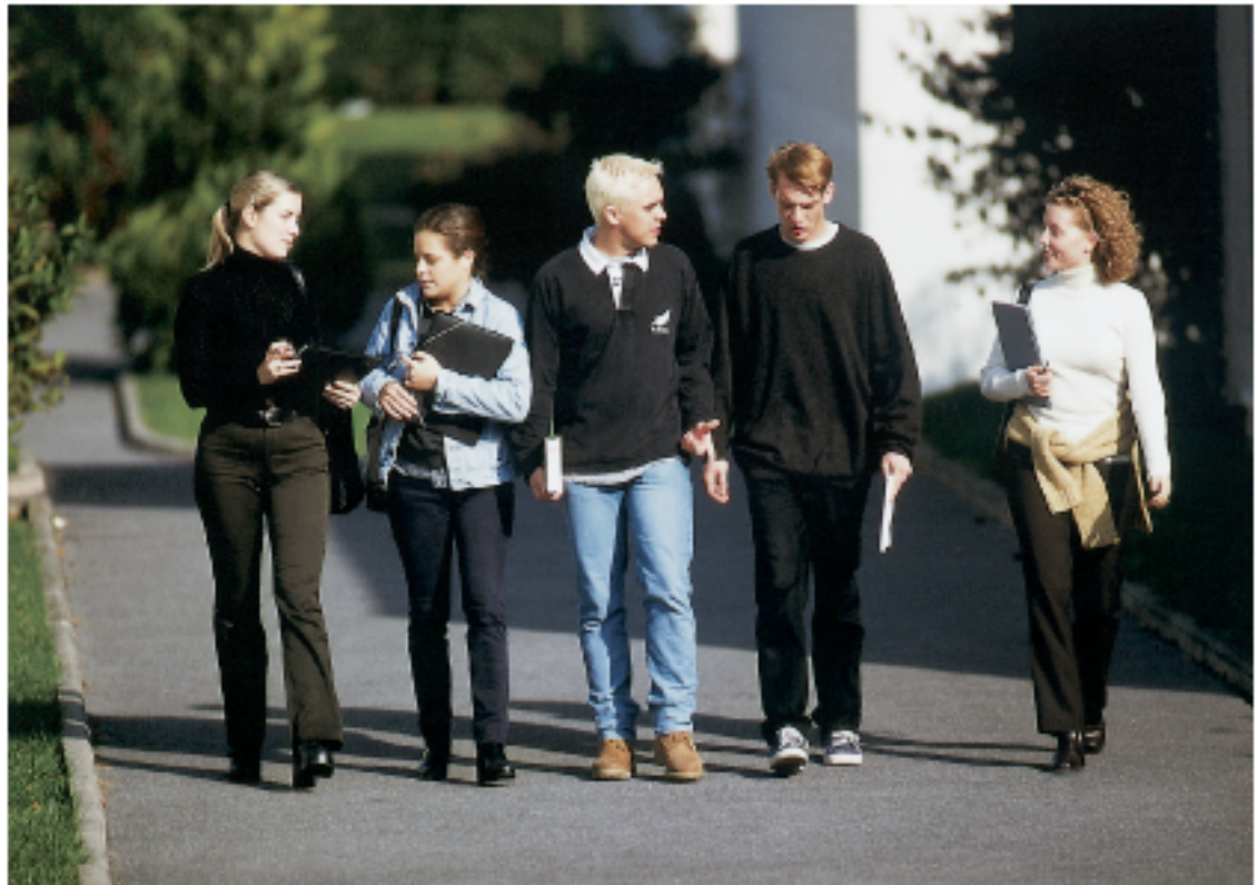
At the Reims Management School in France, participants are exposed to European business and culture.