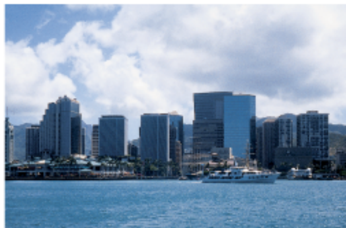
Honolulu is a cultural crossroad in the heart of the Pacific.

JAAMS conducts a housing orientation on the first day of ICMP. JAAMS recommends making housing arrangements after arriving in Hawaii so that you may see the different areas in which to live on Oahu.